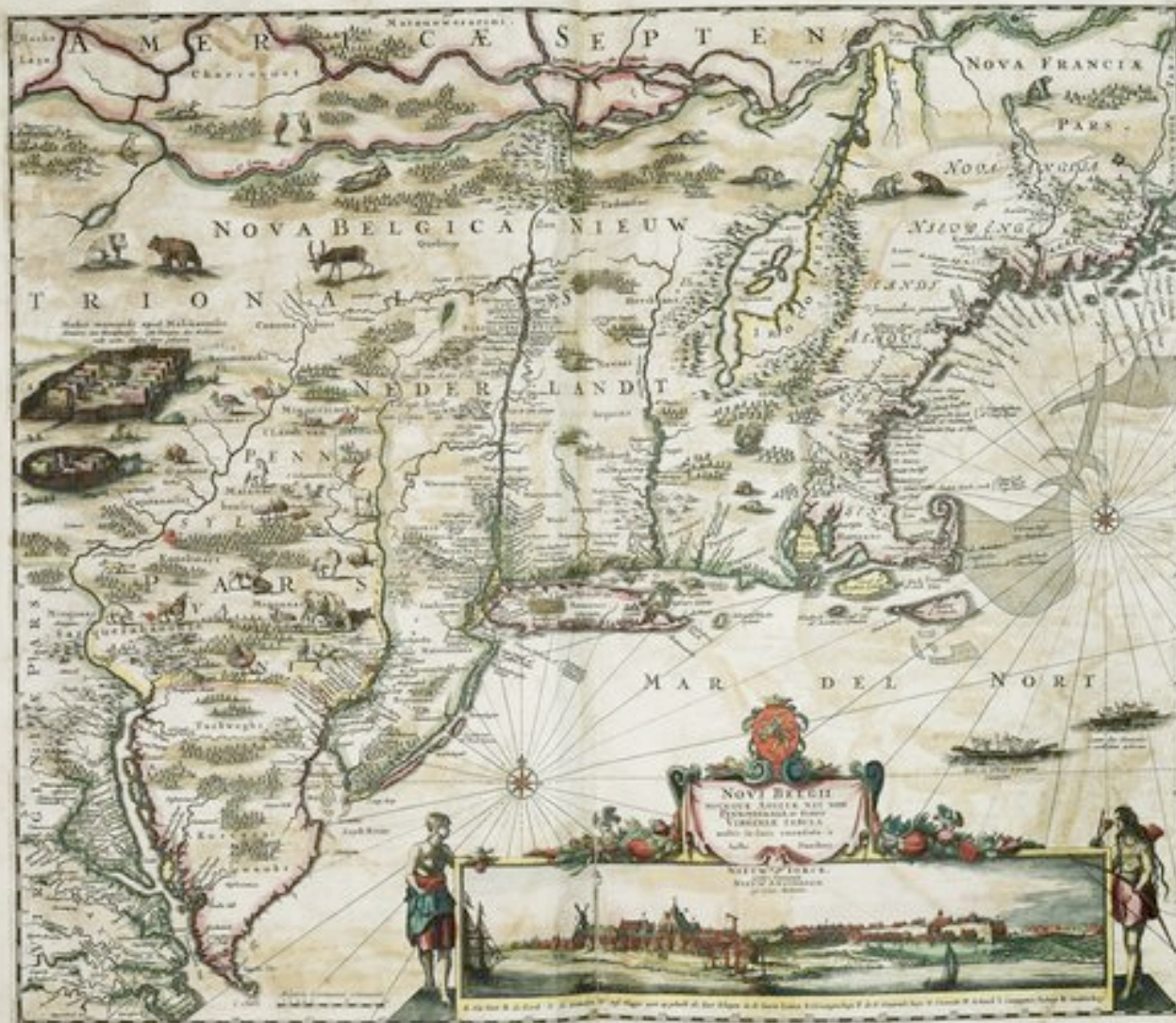
Novi Belgii. copperplate engraving with original hand color. By Justus Danckers. c. 1690. 22" x 19"