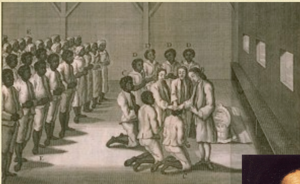
Moravian Mission to the Enslaved Peoples of the Caribbean and North America